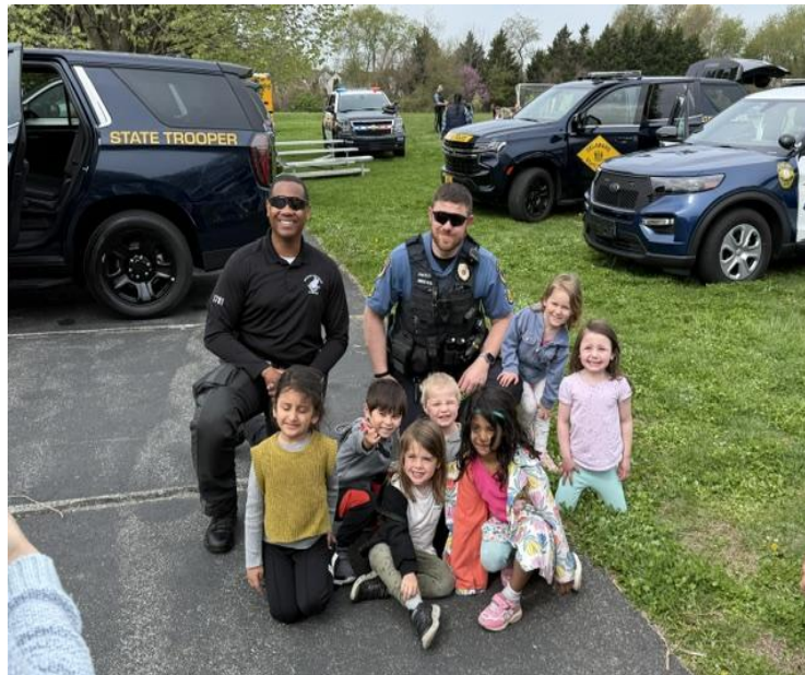
Saint Annes School Police Day