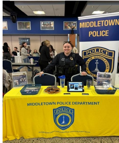
Del-Tech (Dover) Career Fair