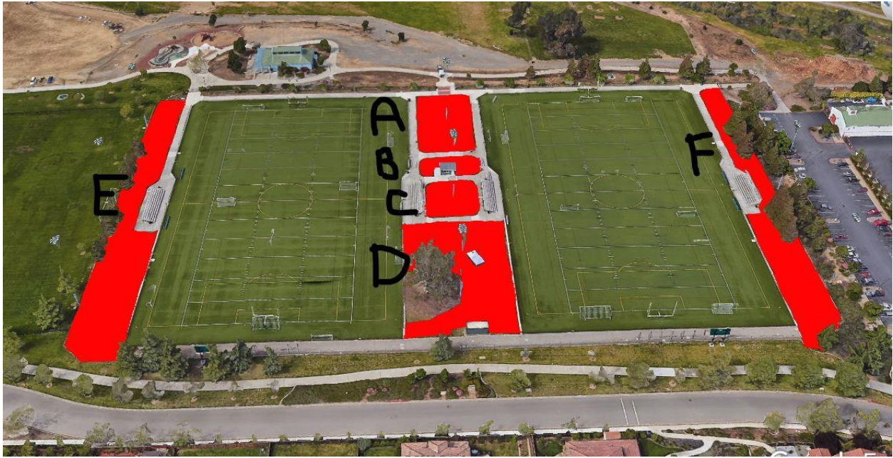
Exhibit A – View of Robertson Park Fields and Plans for Synthetic Turf Installation

The synthetic turf will be installed in areas A, B, C and D.