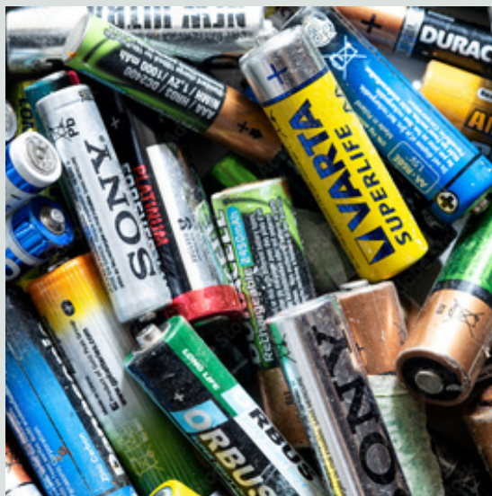
Battery & Cellphones