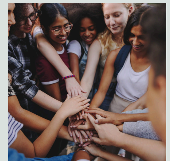
Volunteer Litter Cleanup