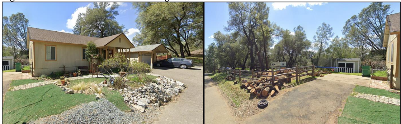
Wren Court, Looking Northwest