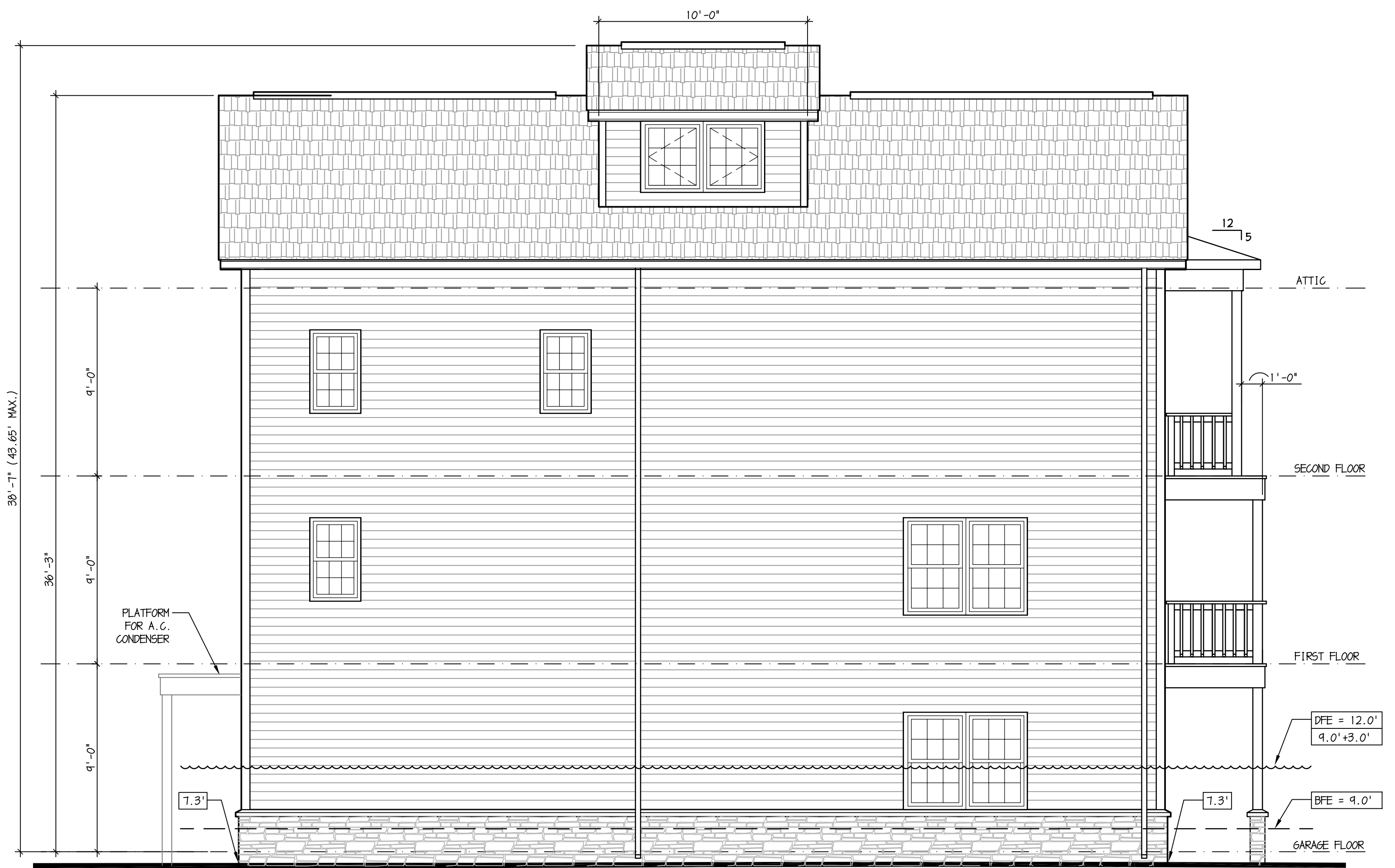
2 LEFT SIDE ELEVATION A2-1 1/4"=1'-0"