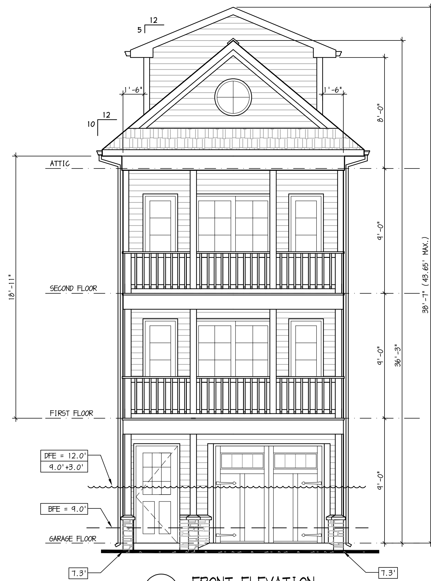
3 FRONT ELEVATION A2-1 1/4"=1'-0"