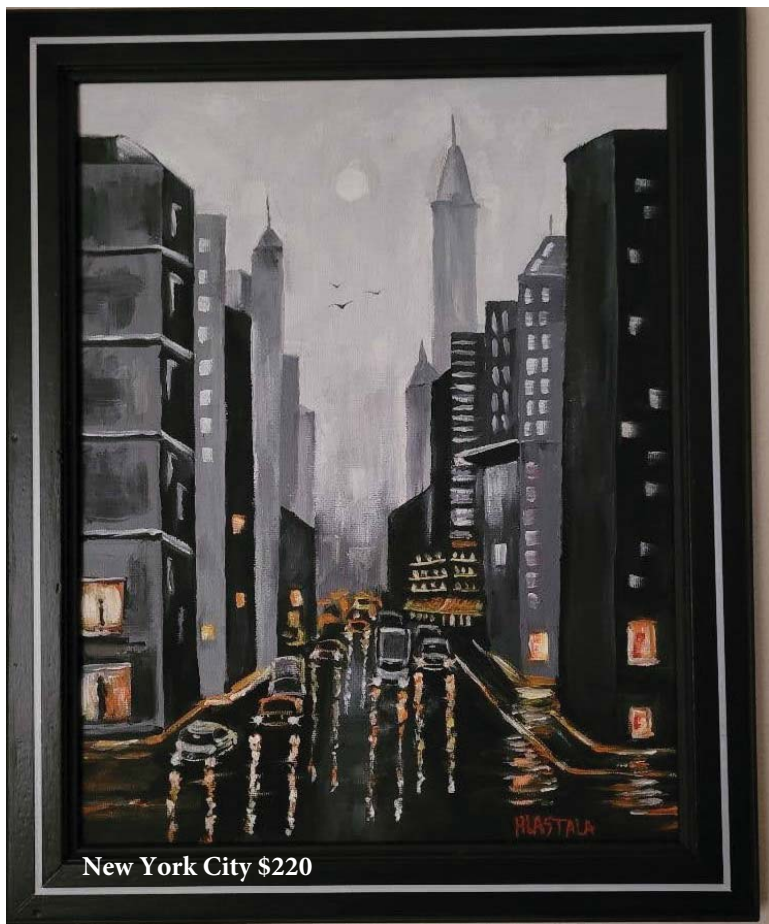
New York City $220