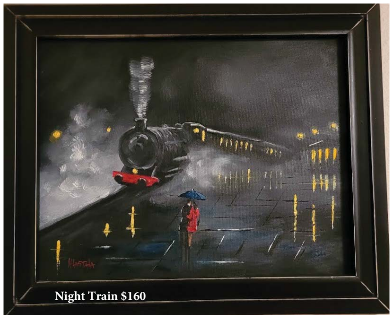
Night Train $160