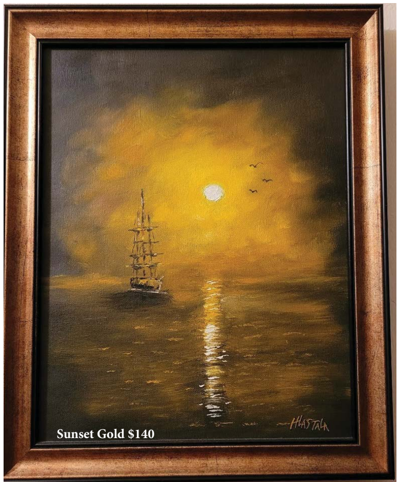
Sunset Gold $140