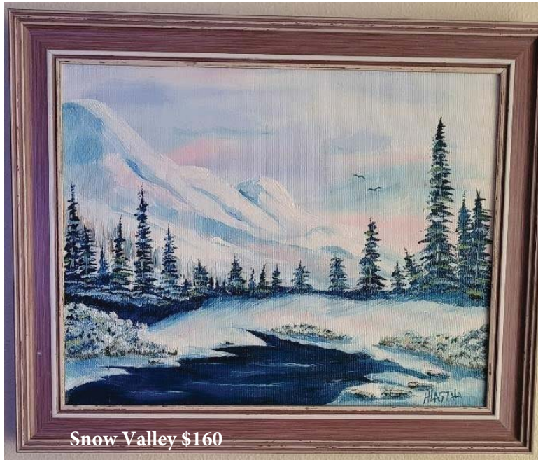
Snow Valley $160